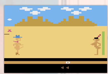
Eighties Porn should have been so much better than this...

You have to hand it to Mystique, they managed to combine elements of sex and bondage into an Atari 2600 game!