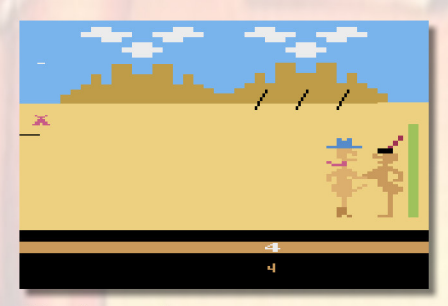
He shoots, he scores.....

You have to hand it to Mystique, they managed to combine elements of sex and bondage into an Atari 2600 game!